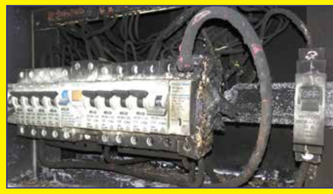
Make sure you get your switchboard and electrical equipment checked for safety before it's too late.

particularly where older light globes are running hot adjacent to timber and insulation.