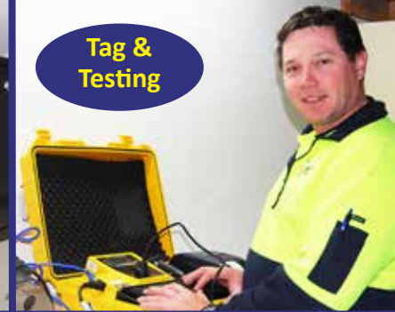
Tag & Testing