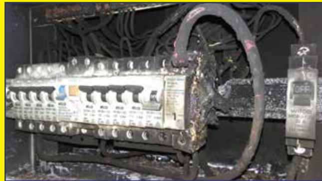
Make sure you get your switchboard and electrical equipment checked for safety before it's too late.

particularly where older light globes are running hot adjacent to timber and insulation.